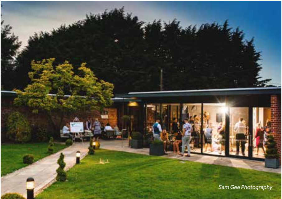
Sam Gee Photography

We believe it is important for you to have as much flexibility as possible on your wedding day