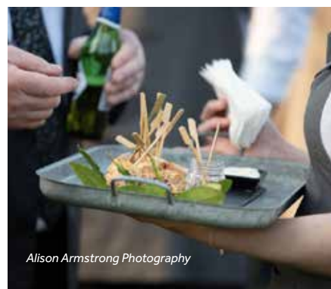
Alison Armstrong Photography