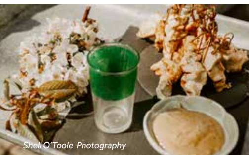
Shell O'Toole Photography